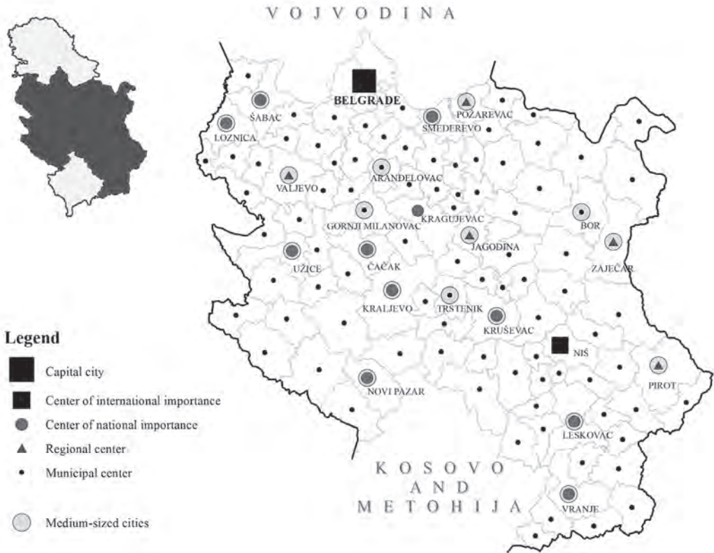
Figure 1: Medium-sized cities on the territory of Central Serbia in comparison to the hierarchy of centres given in Spatial Plan of the Republic of Serbia, 2010-2014-2021 (2010).

Based on the results of the analysis of relevant criteria (i.e. indispensable and sufficient for this study), we have come to the conclusion that 19 settlements have values above the average in more than a half of the analysed criteria. Therefore, an overall conclusion has been made that these 19 settlements make the set of medium-sized cities in the territory of Central Serbia. Most of them are cities of national importance according to the Spatial Plan of the Republic of Serbia (Figure 1). The departure of the analysed indicators from average values, expressed in the number of standard deviations, is the smallest in the settlements that fall into the category of medium-sized cities.